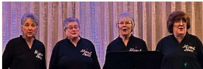
Mixed Nuts, an a cappella quartet, entertained us with many fun songs.