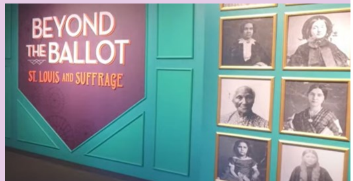
exhibit for about 90 minutes, then go up to the Museum restaurant to determine our lunch options. We are leaning towards eating in the restaurant, but we are sensitive to our members' feelings about the Covid protocols in place there. We will be flexible about "take out" or other options that we might pursue at the time we gather.

We will meet at the Museum on Saturday, October 23, at 10 am, tour the